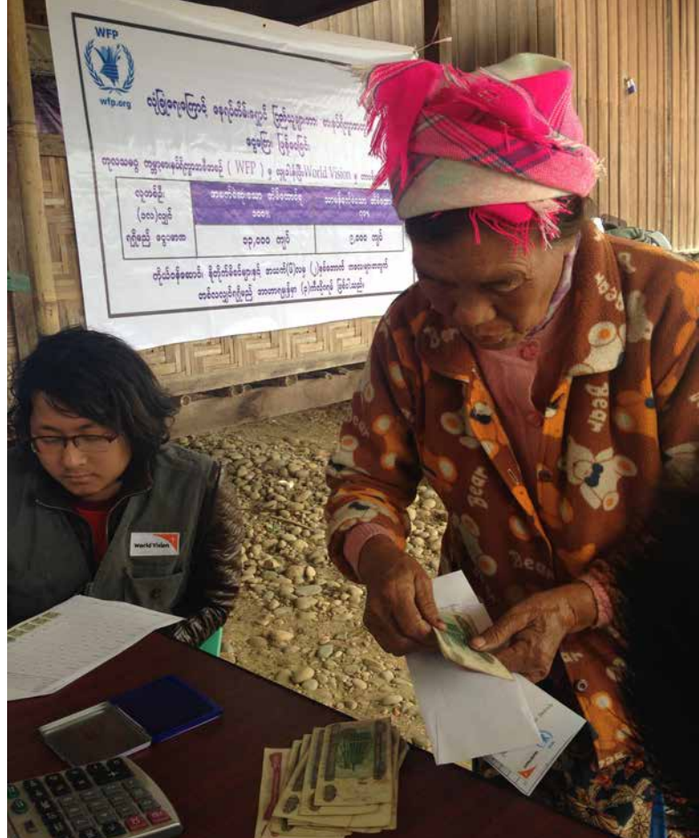
A displaced women collecting cash assistance from World Vision and WFP in Thagara Lisu Camp, Kachin State, Myanmar.

WFP partners with more than 1,000 community-based organizations worldwide. Many of them have a faith-inspired mission. This illustrative list of joint activities demonstrates the diversity of partnerships that WFP has developed with various types of faith groups across different regions, hunger contexts, programme activities and transfer modalities. The stories also reveal the mutual benefits of collaboration between faith-inspired organizations and WFP and the complementarity among local, national and international partners. Such partnerships and complementarities enable us to jointly mobilize the necessary attention and resources to save lives and build the resilience of people and communities.