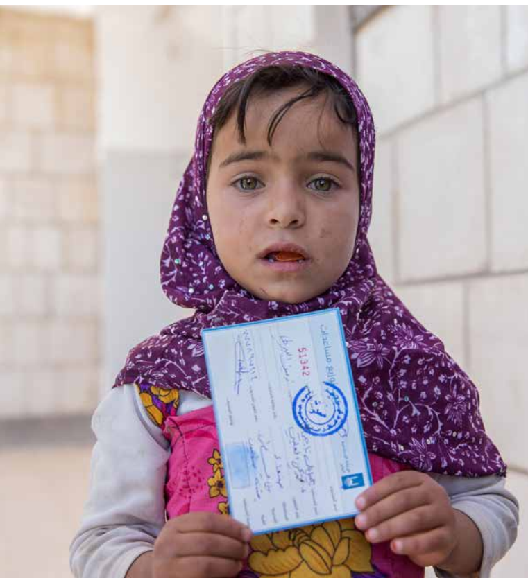
A girl with a coupon from an Islamic Relief and WFP emergency food assistance project in Sana’a, Yemen.

In North Eastern Kenya, Islamic Relief supports the Department of Health in Wajir and Mandera counties manage cases of acute malnutrition, while WFP provides specialized nutritious foods. WFP and Islamic Relief collaborate on home fortification with multiple micronutrient powders targeting children 6–23 months. This programme puts technology into the hands of caregivers, empowering them to improve the quality of their children’s diet by adding micronutrients to the locally available foods they prepare at home just before feeding their child. Islamic Relief also supports the locally-recruited community health volunteers who are instrumental in the screening process at community level and in promoting infant and young child nutrition during community dialogue days.