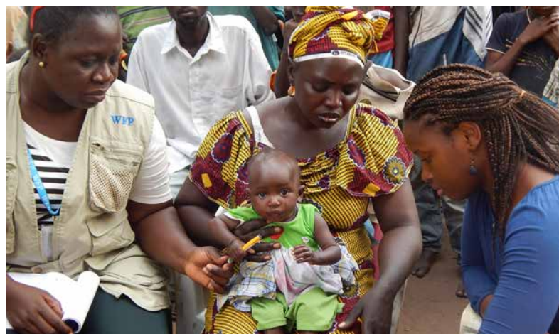
WFP, CARITAS and EU joint visit to the Mores Health Center in the Oio region, Guinea-Bissau.

The Adventist Development and Relief Agency (ADRA) and WFP started joint programmes in eastern Ukraine at the start of the conflict in 2014. Together, they distributed food to 135,000 vulnerable people affected by the conflict. WFP and ADRA work hand in hand to reach the most vulnerable people and provide them with food or cash-based transfers in areas where markets are functioning well. Since 2015, WFP and ADRA have also supported food-insecure individuals in hospitals and social institutions with monthly food assistance.