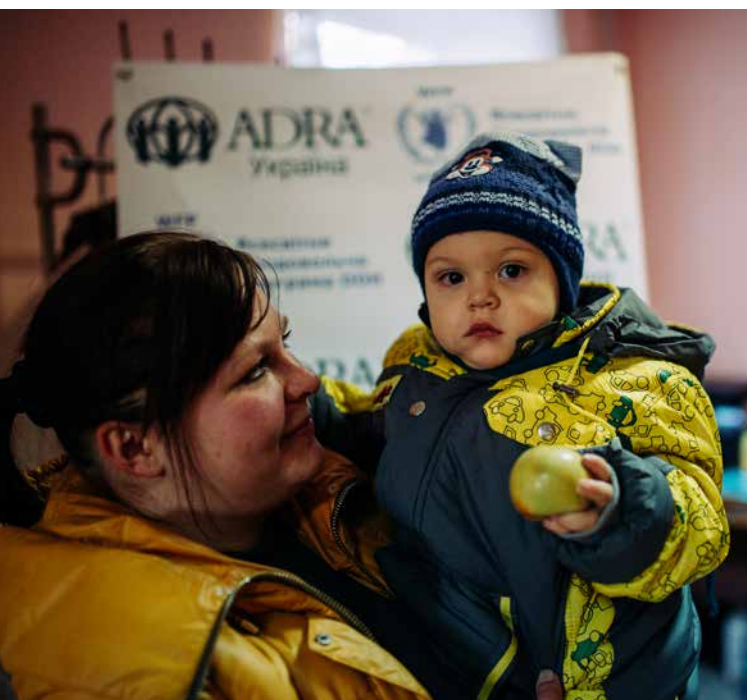
Beneficiaries from joint ADRA-WFP project in Ukraine.

"CADECOM works tirelessly in implementing food security projects and linking humanitarian and emergency response projects to medium and long-term resilience building programmes such as environment and natural resources management and micro finance development through group savings. Using the Church structures, CADECOM remains a mouthpiece for marginalized Malawians, who are often voiceless and , subject to livelihood shocks due to frequent disasters," says Coco Ushiyama, WFP Country Director in Malawi.