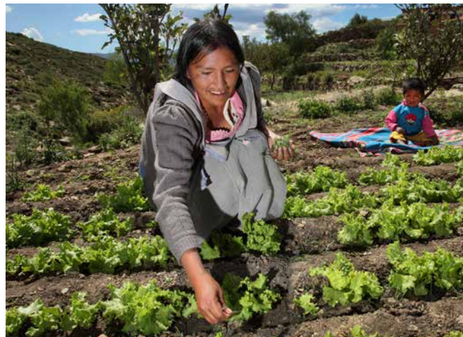
A woman works in a garden with her child near the village of Jatun Mayu, Plurinational State of Bolivia.

The partnership between the Aga Khan Foundation and WFP in the Syrian Arab Republic currently benefits 60,000 people each month, including 6,000 children supported through a nutrition programme, and 1,200 children assisted through a school snack programme. The Aga Khan Foundation has recently implemented WFP livelihood projects in the Syrian Arab Republic that strengthen the local food production and processing systems and create local employment opportunities.