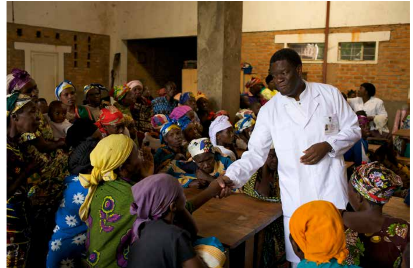
Dr. Denis Mukwege at Panzi Hospital in Congo.

These are days of celebration. After decades of devoting himself to help women and children victims of sexual violence in the Democratic Republic of Congo, Dr. Denis Mukwege, and Nadia Murad, herself a victim of war crimes perpetrated against Yazidi in Iraq, were awarded the 2018 Nobel Peace Prize for their outstanding work to end the use of sexual violence as a weapon of war and armed conflict. They have defended victims and repeatedly condemned impunity for mass rape as a war crime. Perpetrators must be held accountable and victims must achieve justice. Sexual violence as a weapon of war is a war crime and threat to peace and security as set out in the UN Security Council Resolution 1820 (2008) and by the International Criminal Court.