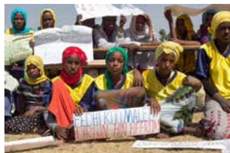
During a public anti FGM event an uncutgirls group in Siraro carried a moto saying no to the practice. Arsi, Ethiopia.