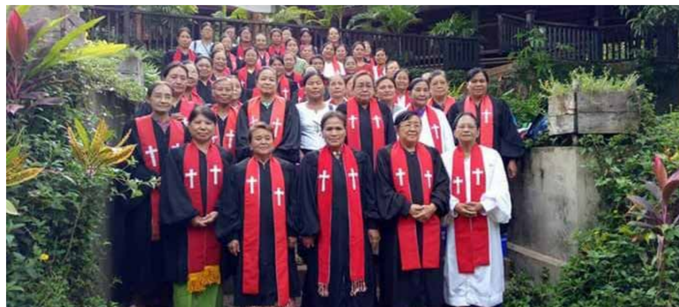
Ordained women ministries during the ordained women gathering.

Efforts must continue to be directed towards empowerment of ordained women ministers, to build their self-confidence and strengthen their influence; empowerment of un-ordained women, so women leadership in ministries is encouraged and women are given the capacities to take on such roles; and advocacy towards religious leadership, especially male leadership, to create more acceptance for women's leadership in religion.