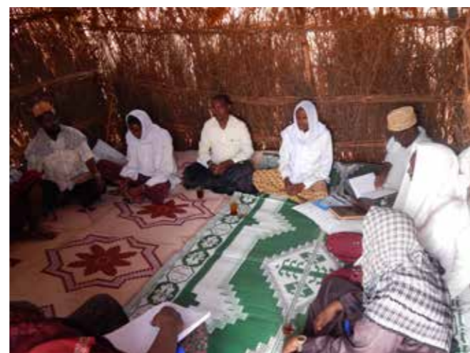
Religious leaders in a CC meeting in Garbaharrey district, Gedo region.

Collaboration with similar actors in Somalia such as the UN Joint programme (UNJP) and other organisations working in Somalia has been crucial. It provides an opportunity to network, share information and learn from each other's work. During the 1st phase of the project in 2014, the NCA/SC joint programme adopted the UNDP's campaign dubbed the "Saxarla campaign" that focuses on protection of the girl child from any form of harm, maintaining her as whole as she was created by God. The campaign messages were adopted by religious leaders and other change agents and continue to be used as advocacy talking points towards abandonment of all forms of FGM to date.