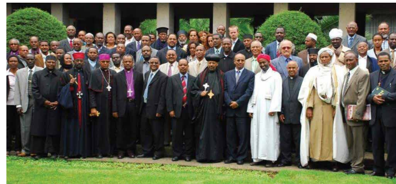
Participants of the first Inter faith dialogue forum on FGM and other harmful practices.