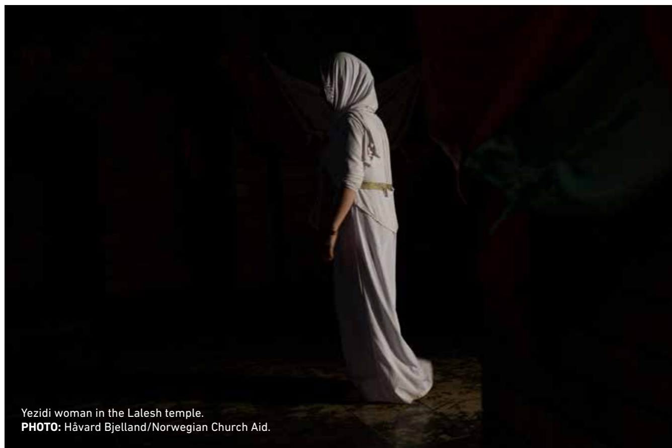
Yezidi woman in the Lalesh temple.