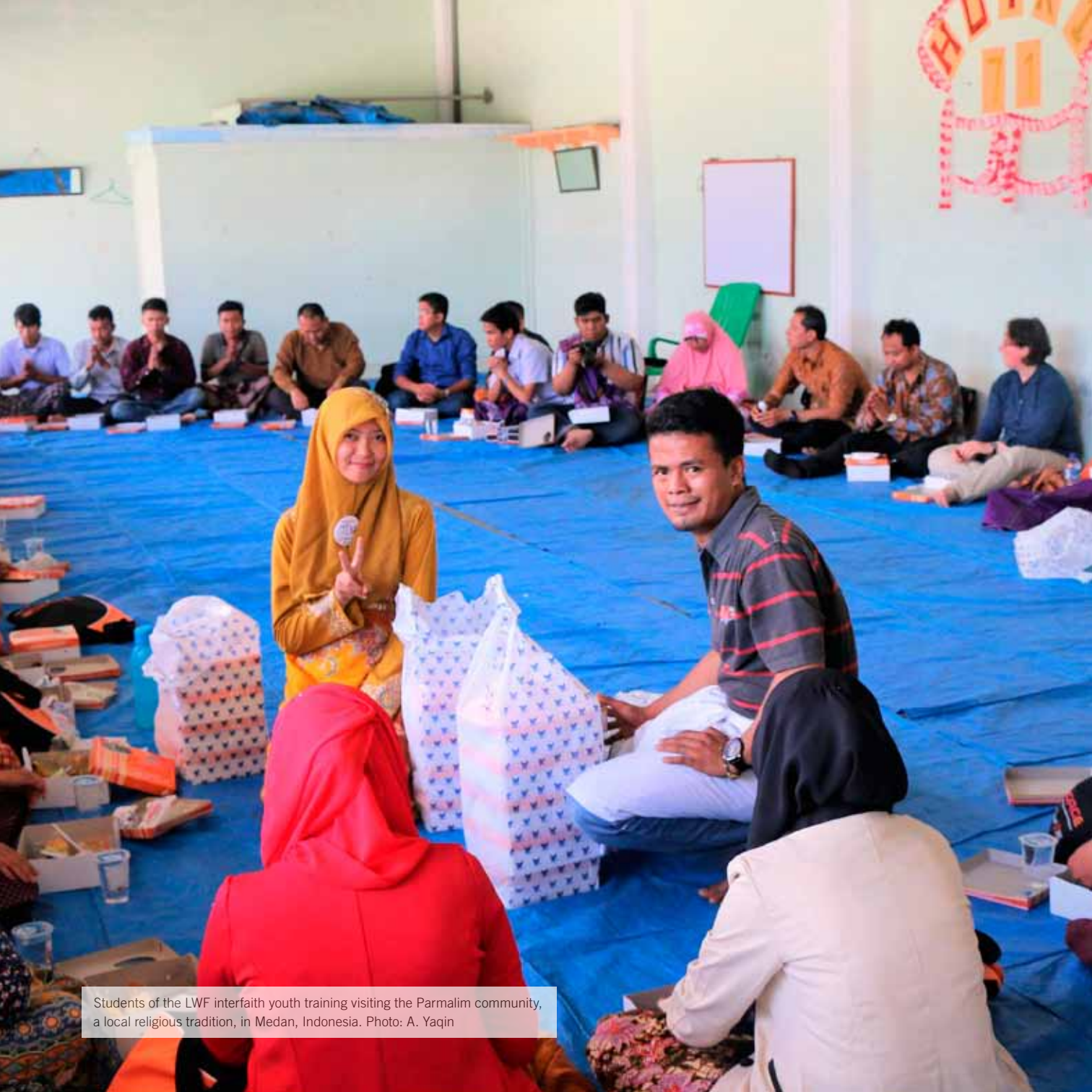
Students of the LWF interfaith youth training visiting the Parmalim community, a local religious tradition, in Medan, Indonesia.