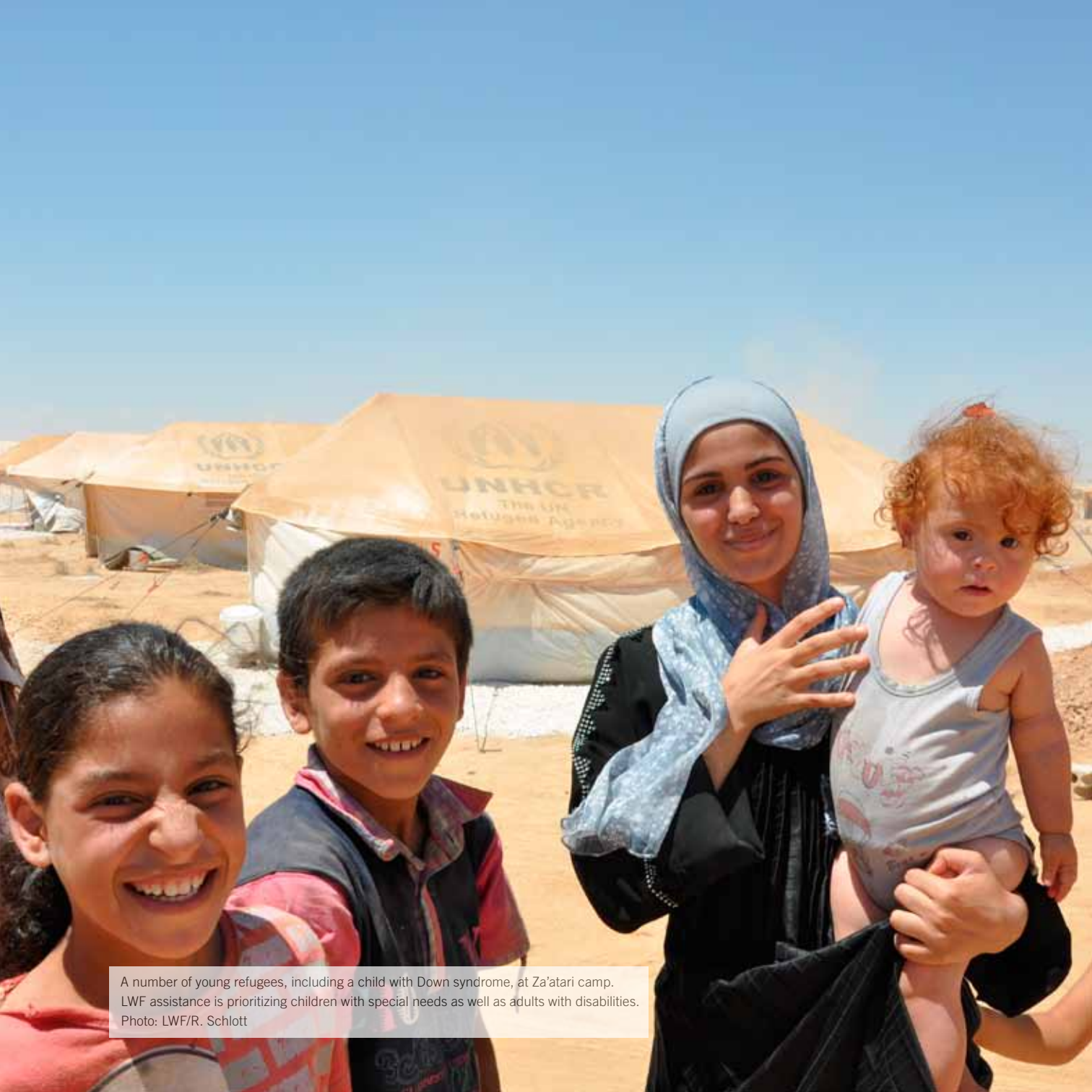
A number of young refugees, including a child with Down syndrome, at Za'atari camp. LWF assistance is prioritizing children with special needs as well as adults with disabilities.