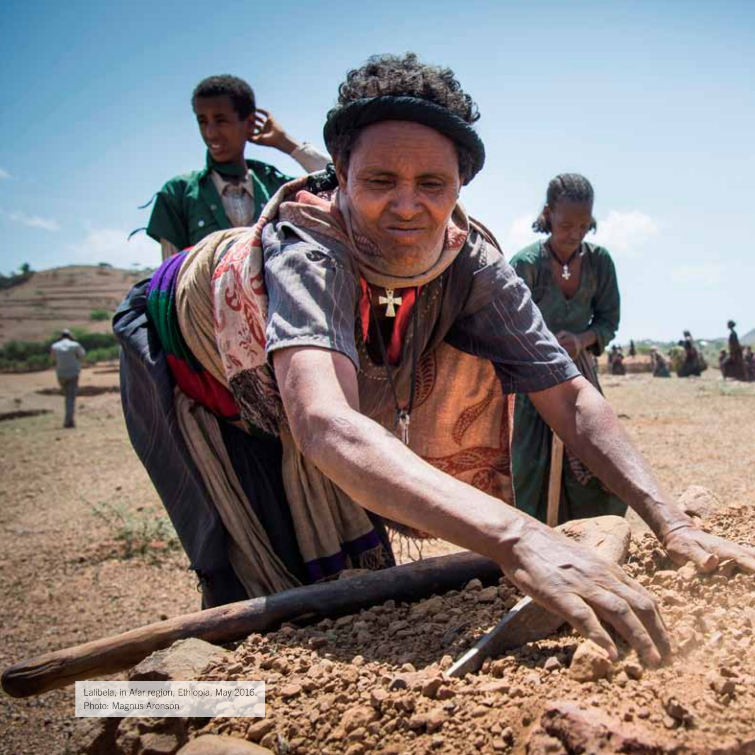
Lalibela, in Afar region, Ethiopia, May 2016.