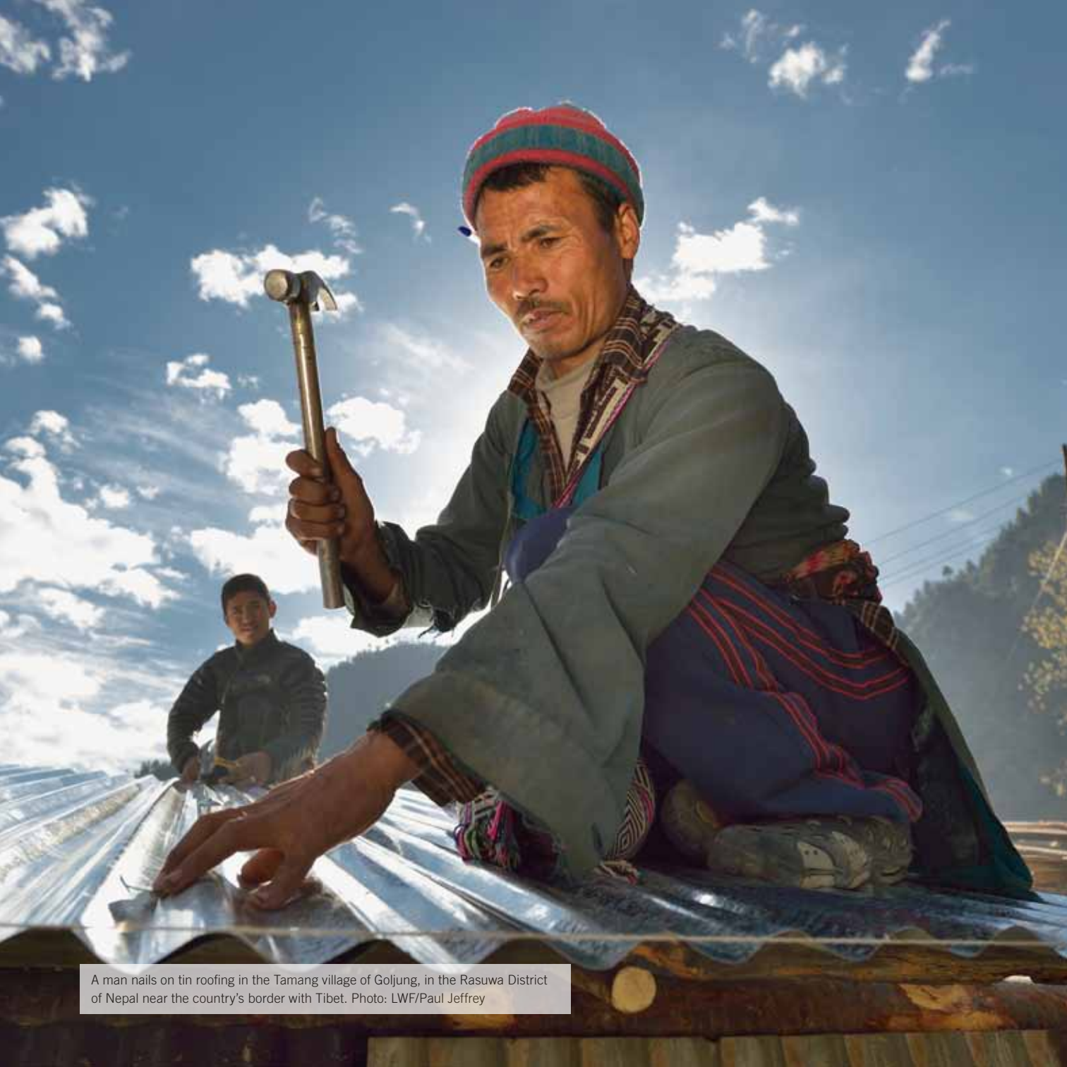
A man nails on tin roofing in the Tamang village of Goljung, in the Rasuwa District of Nepal near the country's border with Tibet.