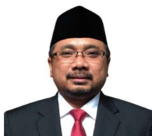
H.E. Yaqut Cholil Qoumas

Indonesian Minister of Religious Affairs