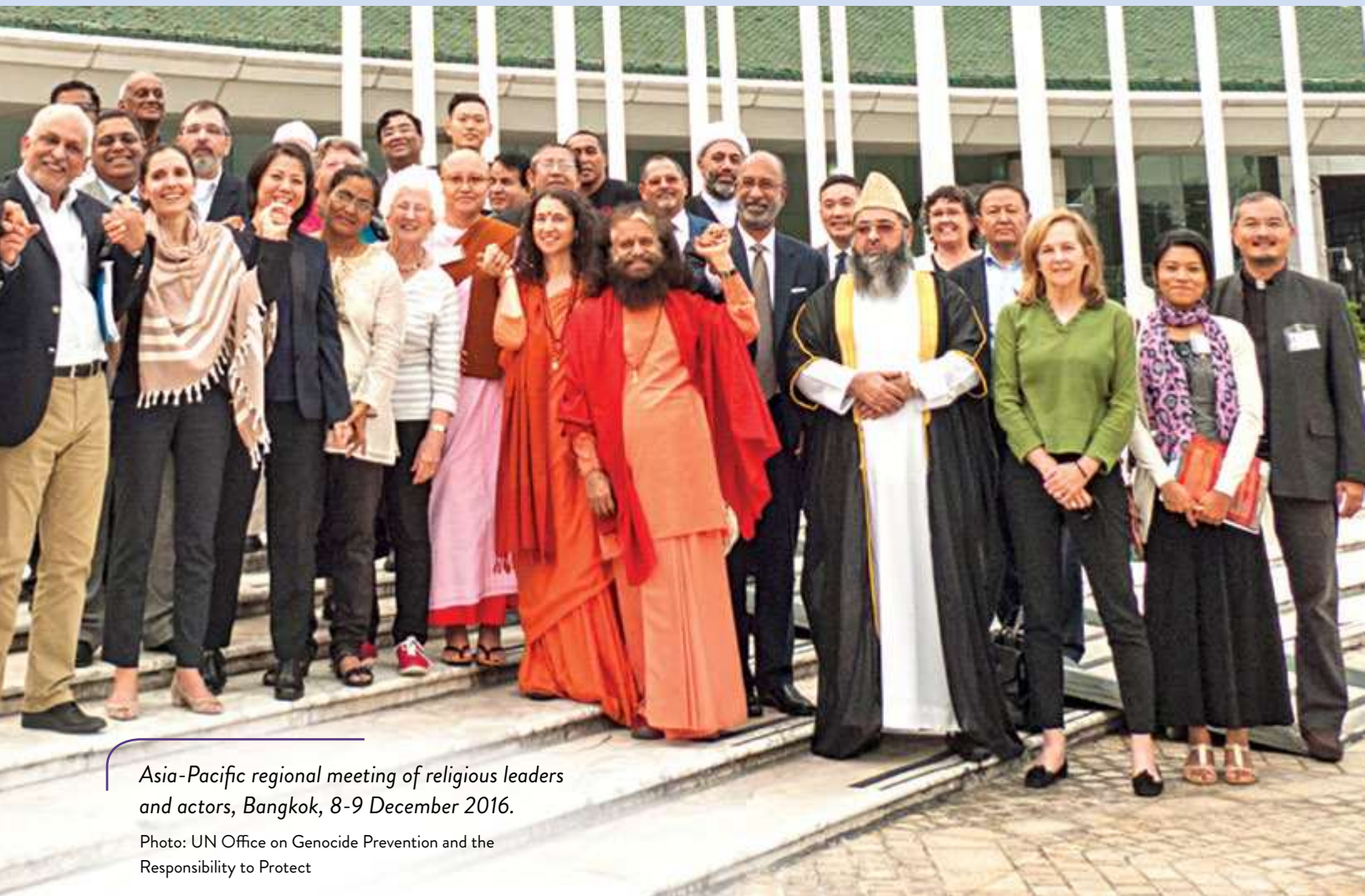
Asia-Pacific regional meeting of religious leaders and actors, Bangkok, 8-9 December 2016.

of religion, such as early or forced marriage and sexual slavery. Members of the network/coalition should keep each other informed about any measure taken to prevent, counter and respond to instances of incitement; initiate joint statements/responses; and coordinate actions, including through social media.