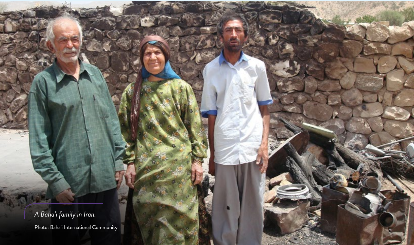
A Baha'i family in Iran.