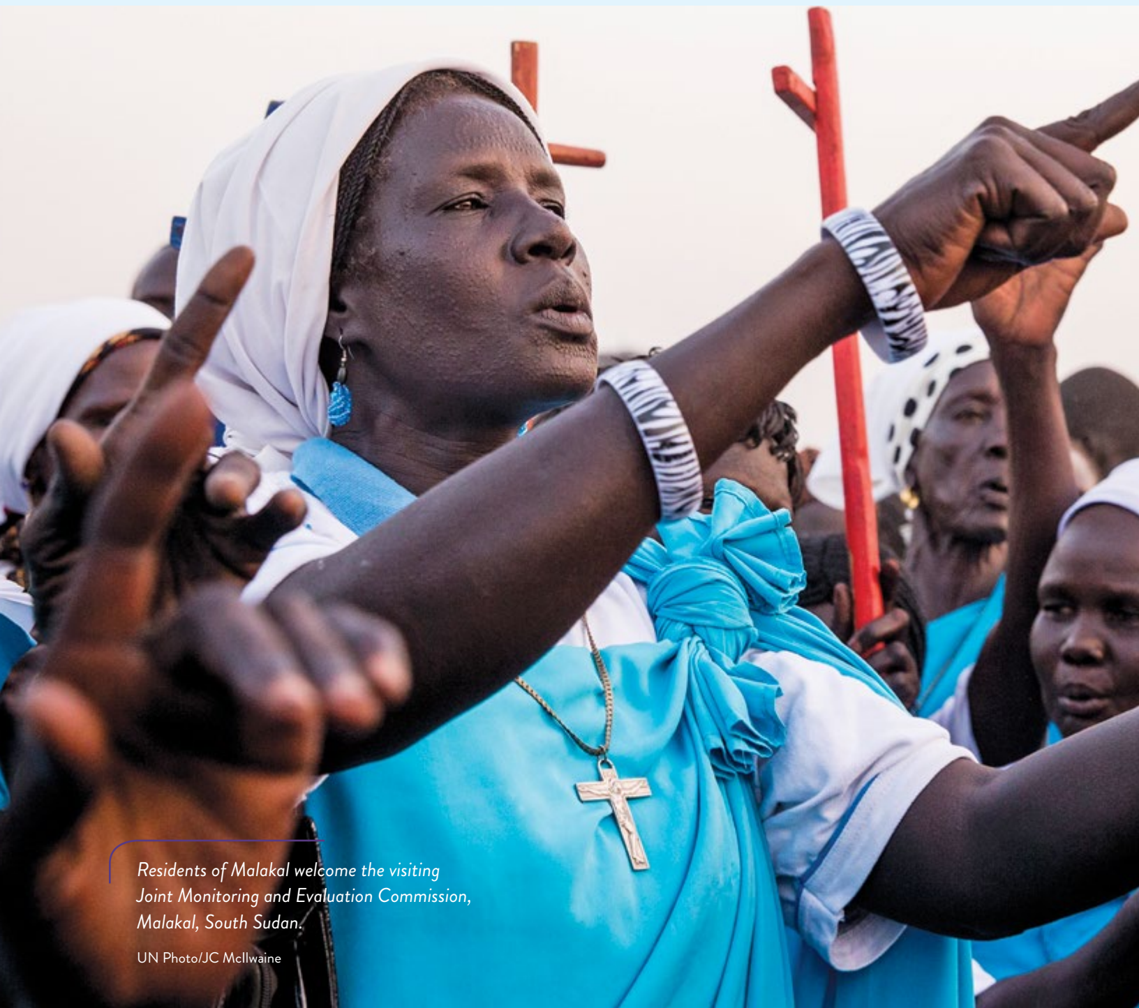
Residents of Malakal welcome the visiting Joint Monitoring and Evaluation Commission, Malakal, South Sudan.