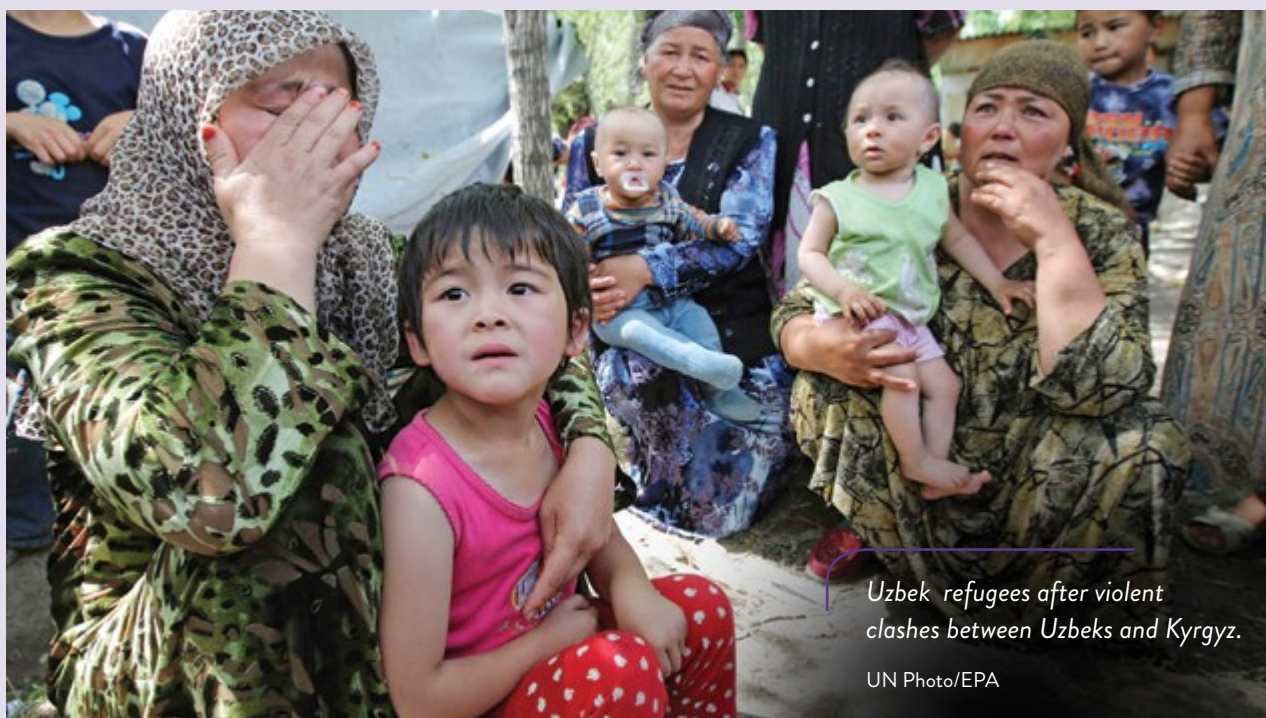
Uzbek refugees after violent clashes between Uzbeks and Kyrgyz.