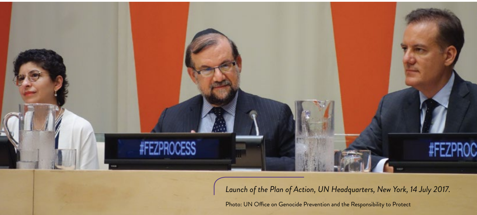
Launch of the Plan of Action, UN Headquarters, New York, 14 July 2017.