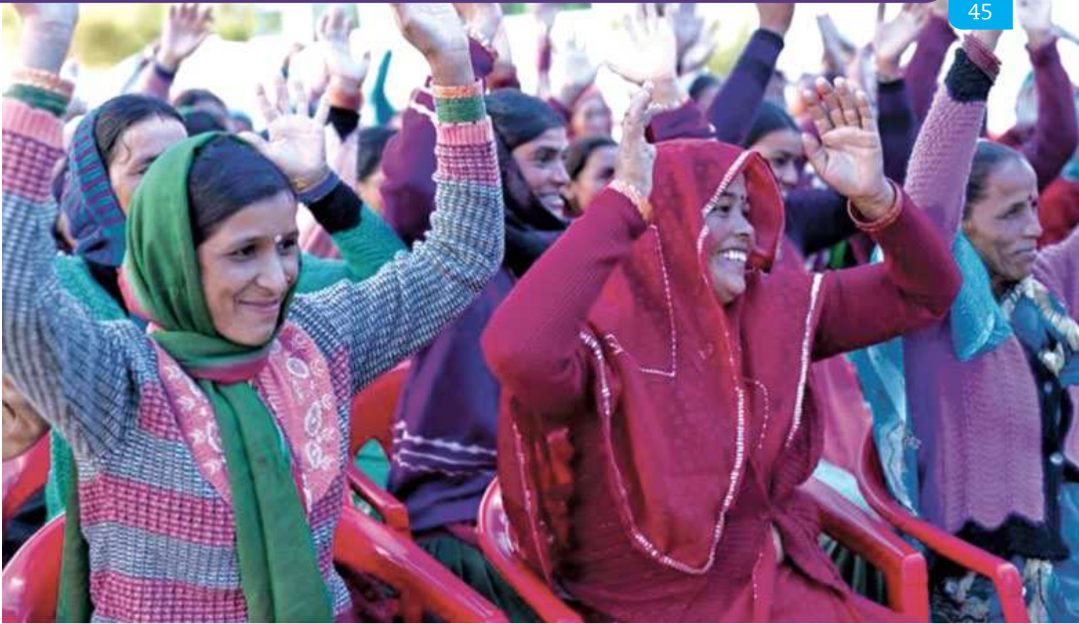
Hindu women at the Triyuginarayan Centre, India.