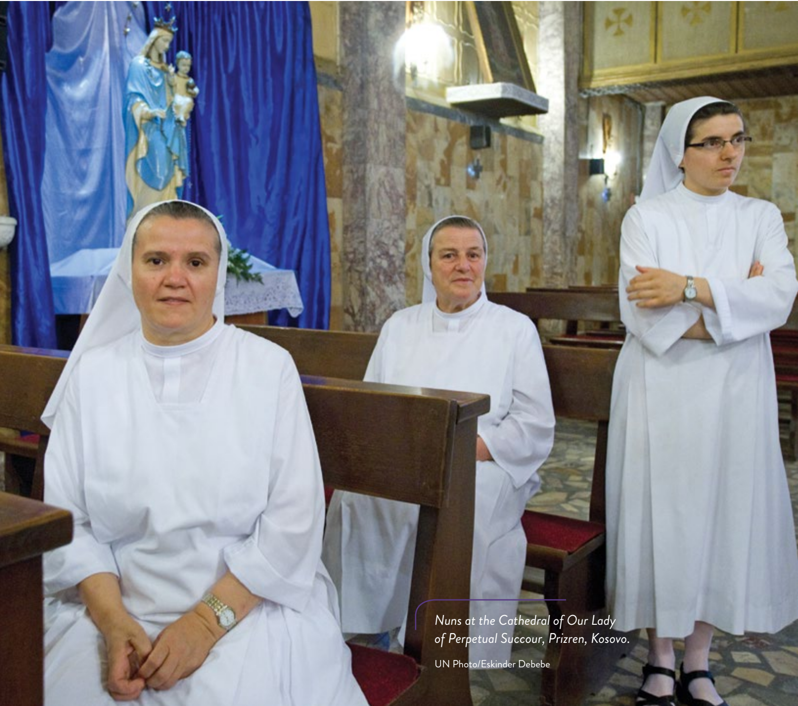
Nuns at the Cathedral of Our Lady of Perpetual Succour, Prizren, Kosovo.

Religious leaders and actors can be strong partners in the prevention of atrocity crimes and their incitement and, for this reason, national, regional and international institutions, civil society and the media should engage and cooperate with religious leaders in the context of efforts to prevent atrocity crimes.